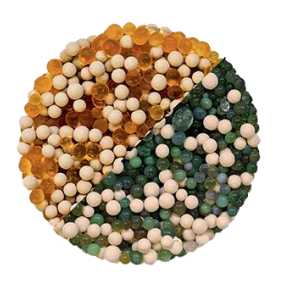
0% → 100%

Once the desiccant is completely saturated, a spare parts kit must be used.